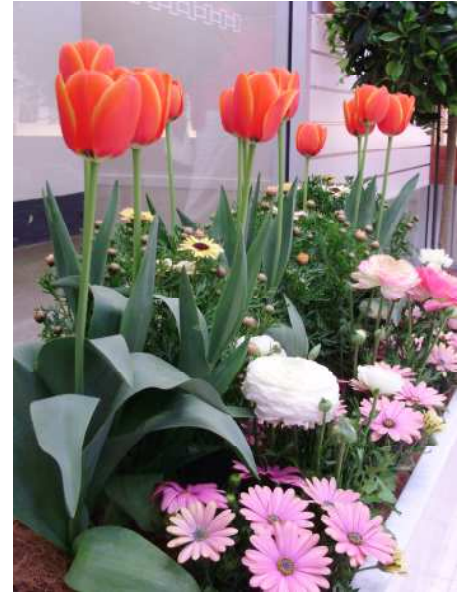
Green Inspiration at the Royal Australian Mint

We hope you enjoy reading this issue and look forward to providing you with more Inspired articles in the future.